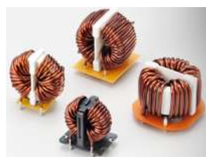
Copyright © 2023 Proterial, Ltd. All Rights Reserved. |